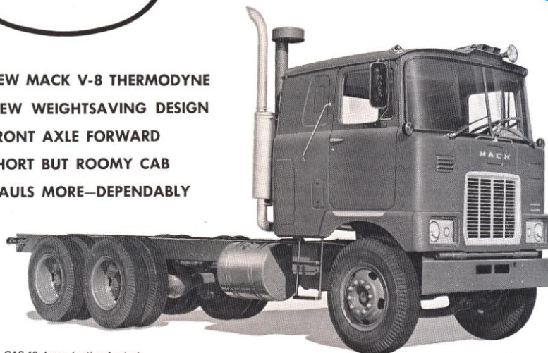
Sleeper Cab, CAS 40 shown (optional extra)